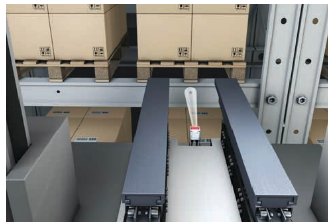
High-bay storage systems for single-depth pallets